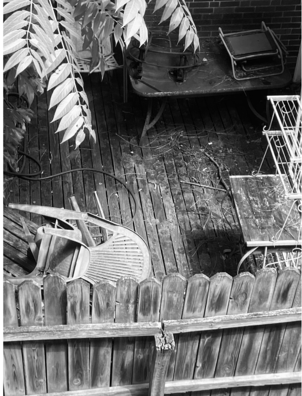
Tracy Featherstone, process and source material images courtesy of the artist, 2024