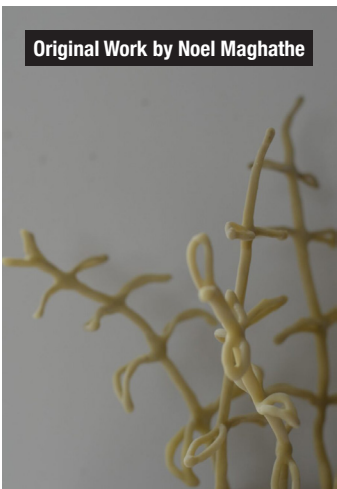
Original Work by Noel Maghathe