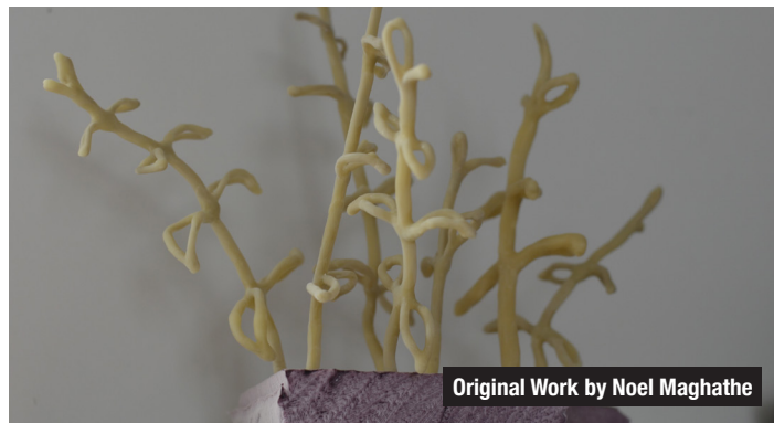
Original Work by Noel Maghathe